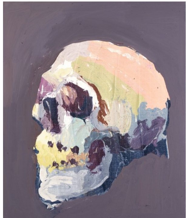
Image: Ben Quilty, Skull Rorschach , 2009, oil on linen, 60 x 50 cm each, Purchased 2009.