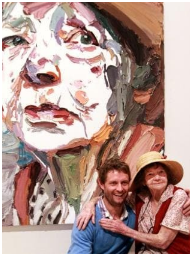
Ben Quilty with Margaret Olley posing in front of Quilty's portrait of Olley.