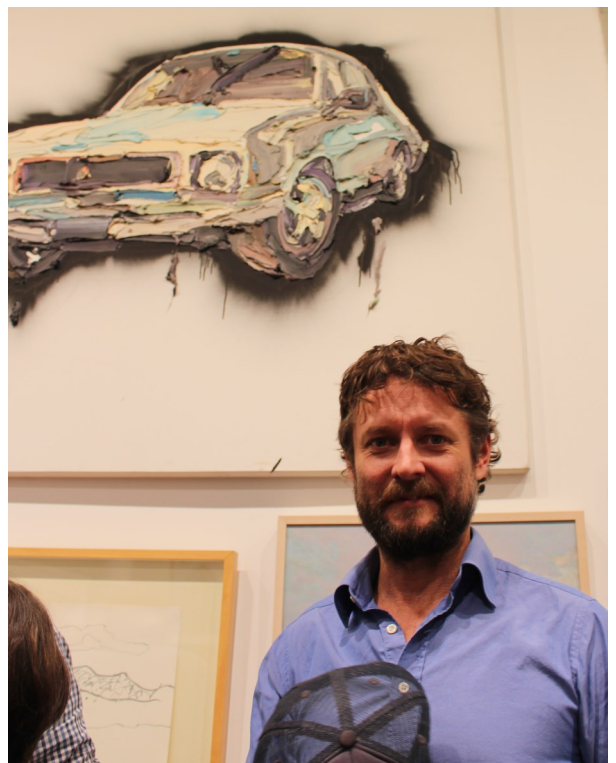
Ben Quilty at the opening of Goulburn Bustle in 2019

Quilty has works held in numerous institutional collections. Goulburn Regional Art Gallery have two in our permanent collection.