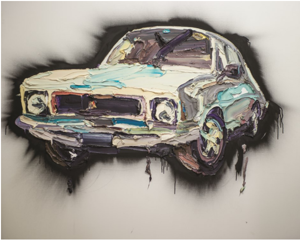
Ben Quilty, Torana , 2007 Goulburn Regional Art Gallery's permanent collection

Here are four of Ben Quilty's paintings.