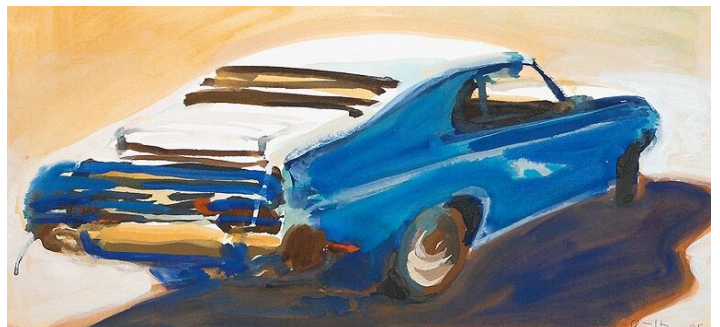
Ben Quilty, Hill End Landscape , 2005.