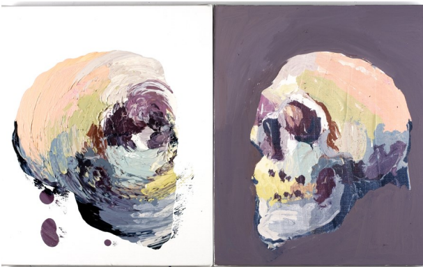
Ben Quilty, Skull Rorschach , 2009. Goulburn Regional Art Gallery's permanent collection

Use a coloured pencil to draw your thoughts.